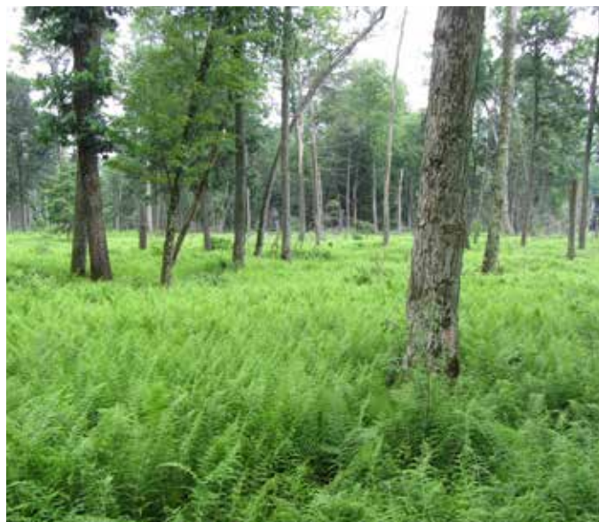
This area has severe interfering fern cover. Desirable regeneration is not likely to develop until the ferns are controlled.