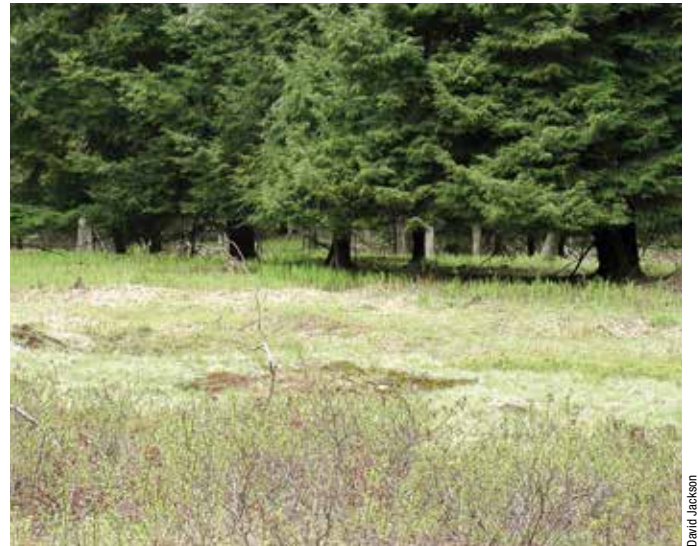
Note the “browse line,” where deer have eaten the preferred palatable vegetation from ground level to a height of 5 feet. Browse lines are an indication of high deer impact.

can support forest regeneration suffers. In regions of the state where decades of overbrowsing have severely depleted the habitat, even relatively few deer can have significant effects.