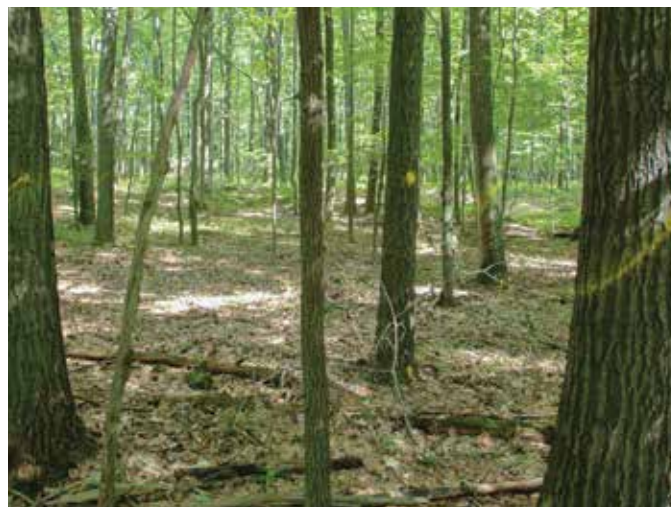
As forests mature and people begin to conduct harvests, potential regeneration problems need to be identified. This mature forest clearly lacks regeneration.

Currently, with a maturing forest and increased harvest levels, “sustainable forestry” is an increasingly important concept. While many claim to practice forestry, only about half do so in a sustainable manner. The problem lies not in forest science but in its rampant misuse in name and practice.