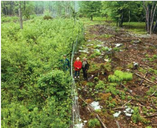
Forest regeneration inside versus outside a fence. Research demonstrates that, when deer impact is high, forest regeneration is inhibited.