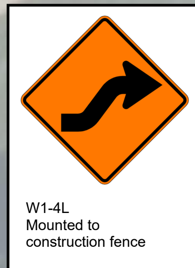
W1-4L Mounted to construction fence