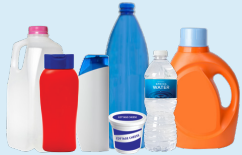
Plastic Bottles, Jugs, Tub, & Lids (Empty kitchen, laundry, & bath containers)