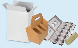
Boxboard (Dry-food boxes, egg cartons, & rolls)