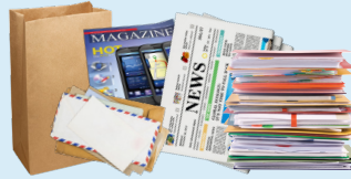
Junk Mail, Periodicals, & Office Paper (Paper bags, envelopes, & catalogs)