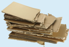
Corrugated Cardboard (Wavy center layer)