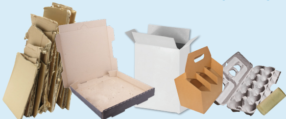
Cardboard & Boxboard (Clean & dry)