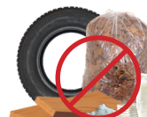
WOOD, WASTE, OR TIRES