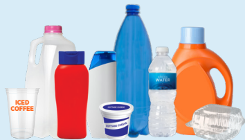
Plastic Bottles, Jugs, Tubs, & Lids (Empty kitchen, laundry, & bath containers & clamshells)