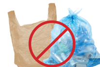
PLASTIC BAGS OR BAGGED RECYCLABLES

THE ITEMS LISTED BELOW DON'T BELONG IN YOUR RECYCLING BIN